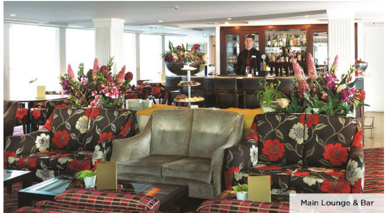
Main Lounge & Bar