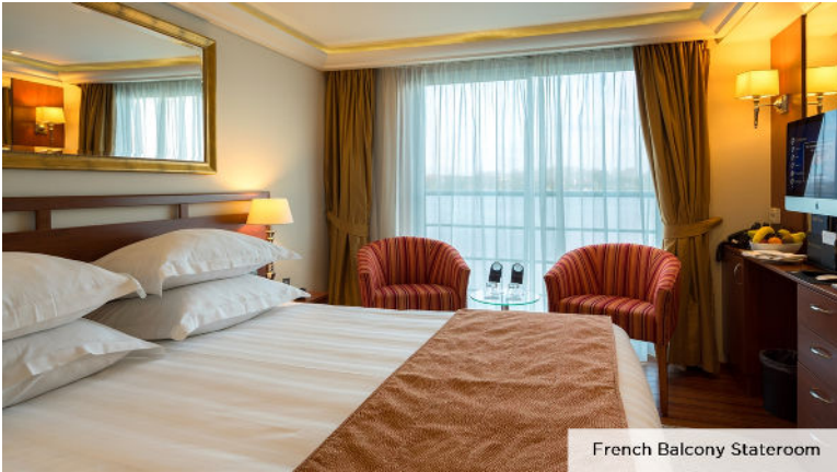
French Balcony Stateroom

7-night cruise | June 29-July 6, 2023 | Aboard AmaDolce